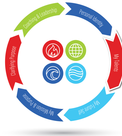
The Path and Path Elements Framework for Students Explore. Design. Create Your Future.

When we get students to focus on their talents they begin to see new ways to motivate themselves to learn, apply their education, and give back to their communities.