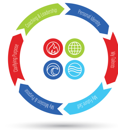
The Path and Path Elements Framework for Students

For more information about the Path and Path Elements Frameworks please email us at admin@pathelements.com to discuss a demo or student sample at your school.